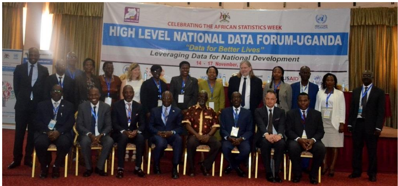
Group photo of delegates with the Second Deputy Prime Minister Rt. Hon. Kirunda Kivejinja in short sleeved shirt seated.

"We are talking about revolutionized data. With data you do things better, you do things in ways that you were not doing them before," he told participants.