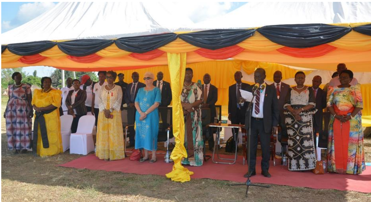
Vice President Edward Ssekandi (third from right) addressing the National Commemoration of World AIDS Day in Kole District, 1 st December 2017

"Men go for voluntary HIV testing in order to prolong your lives and avoid infecting others. If you find that you are sick take drugs. They will not cure you but suppress the virus and prolong your life and you won't infect others", said President Yoweri Museveni the Guest of Honour whose remarks were read out by the Vice President Edward Ssekandi.